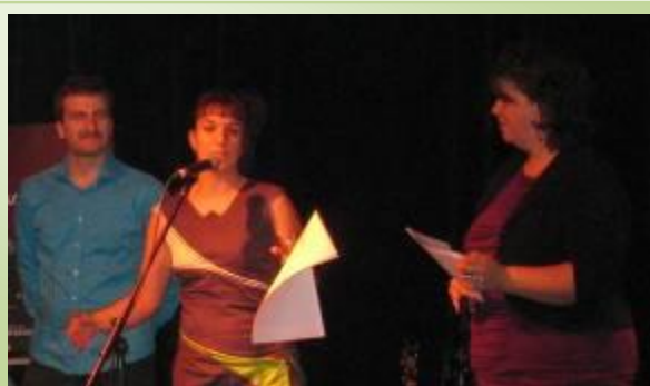
Réouverture du Bistro In Vivo