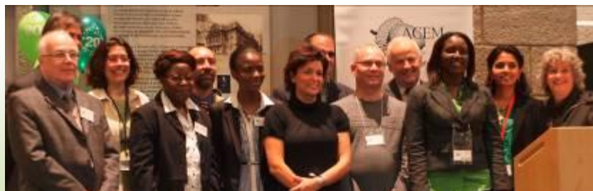
Members of ACEM’s Board, Loan Committee and Staff

Om Sakthi Import (Direct-Loan of 200$): Om Sakthi imports accessories and clothing from India for young adults and women. This company opened a store in November 2010 in the commercial area on Côte des Neiges Avenue.